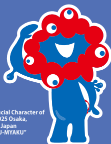
The Official Character of Expo 2025 Osaka, Kansai, Japan "MYAKU-MYAKU"

Creating a future society for our lives with craftsmanship and passion